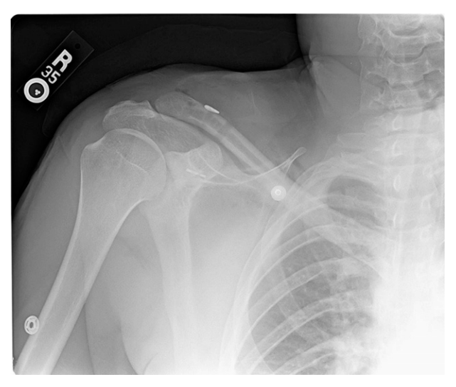
FIGURE 2. AP of shoulder postoperatively. Note appropriate construct congruity.

fracture with presumed fibrous nonunion and coracohumeral distance of 8 mm (Fig. 4).