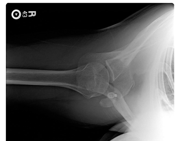
FIGURE 3. (A) AP and (B) axillary radiographs indicating coracoid base fracture with 50% loss of reduction.