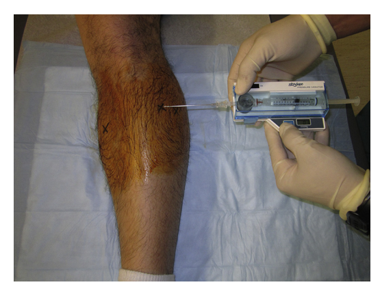
Fig. 1. ICPs measurements of the leg for evaluation of CECS after exercise stress testing.

Although currently debated, the historical standard for diagnosis of CECS has been ICP measurement.<sup>36</sup> ICP monitoring may be completed with many commercial devices.<sup>36</sup> At the authors' institution, the Stryker Intra-Compartmental Monitor (Stryker Corporation, Kalamazoo, MI, USA) is commonly used as a component of the standard preoperative evaluation, with comparison of affected and unaffected compartments in bilateral lower extremities (Fig. 1). On presentation, patients complete an exercise stress test. A series of manometry measurements are taken both before and after exercise to analyze ICP trends of symptomatic compartments. Typical resting ICPs of the leg measures less than 10 mm Hg, although measurements are operator-dependent and may vary considerably between patients.<sup>36</sup>