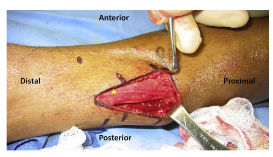
Fig. 3. Distally-based surgical exposure for anterior and lateral involvement with identification of the superficial peroneal nerve ( asterisk ).

technique, approximately 90% of subjects experienced symptomatic relief without statistically significant differences. The investigators concluded that fasciotomy of the anterior compartment is sufficient treatment of CECS in the absence of lateral compartment involvement. However, decompression of a single compartment is rare in the military population, with approximately 1% of patients receiving either an anterior or lateral fascial release.