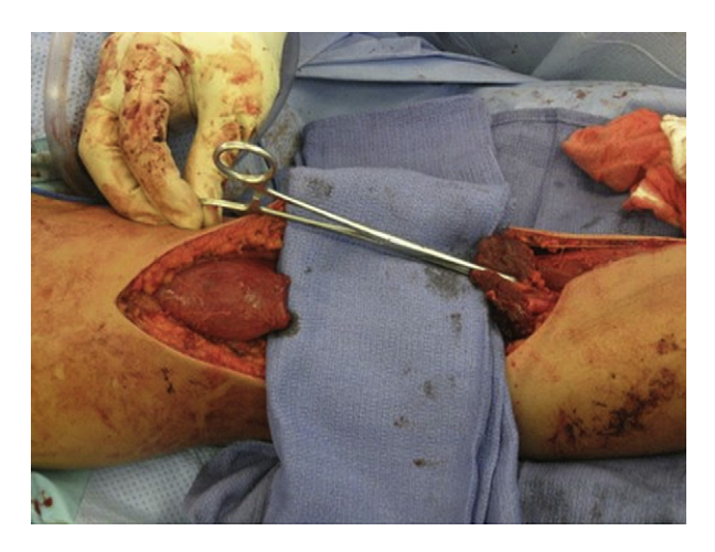
Figure 2 Required debridement of nonviable necrotic tissue produced a 7-cm segmental defect in the biceps brachii muscle.

and supination strength, and functional range of motion (Fig. 3). Given that the native distal biceps myotendinous junction was intact and still anatomically attached to the radial tuberosity, the bone block was removed from the Achilles allograft and the distal tendon was secured to the distal biceps stump with a No. 2-0 nonabsorbable braided suture and a modified Pulvertaft weave technique. The broader proximal aspect of the allograft was then fanned over the proximal biceps stump with the arm in 40^{\circ} of flexion and full supination and secured into the epimysium tissue with copious No. 2-0 nonabsorbable braided suture in a Mason-Allen configuration. Finally, the reconstruction was reinforced with a circumferential running, No. 3-0 absorbable suture around the allograft perimeter, and a meticulous, layered soft-tissue closure was performed.