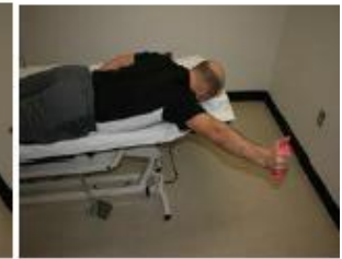
Prone Scaption Lie face down, arm toward the ground. Raise arm and hand at a 45° angle as shown. Keep elbows straight and squeeze shoulder blades together.