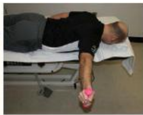
Prone Horizontal Abduction Lie face down, arm down. Raise arm and hand to shoulder height as shown, keeping elbows straight and squeezing shoulder blades together.