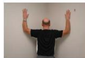
Corner Stretch With shoulder at ___ degree angles, place elbows and forearms on wall as shown. Lean forward until a gentle stretch is felt in chest.