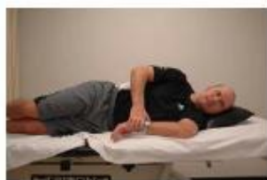
Sleeper Stretch Lie on involved side on a flat surface. Place involved arm at ___ angle from body. Using uninvolved hand, push down on hand toward table as shown.