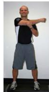
Horizontal Adduction Stretch Bring involved arm across in front of body, holding elbow with opposite hand as shown. Pull involved arm across chest until a gentle stretch is felt in the back of the shoulder.