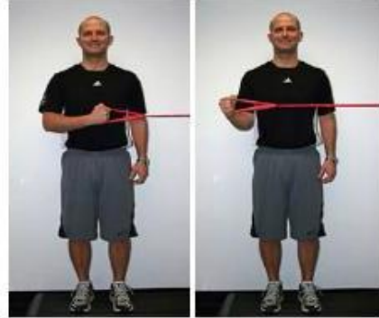
External Rotation with Theraband Secure elastic at waist level. Hold elbow at 90 degrees, arm at side. Pull hand away from body as shown.