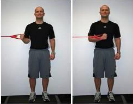
Internal Rotation with Theraband Secure elastic at waist level. Hold elbow at 90 degrees, arm at side. Pull hand across body as shown.