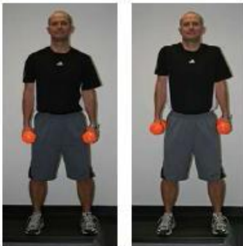
Standing Shoulder Shrugs Stand with feet shoulder width apart. Raise shoulders upward toward ears. Return to starting position.