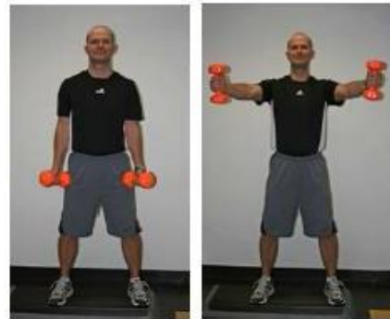
Standing Scaption Hold arm at side, elbow straight, thumb up. Lift arm at 45° angle to shoulder height as shown.