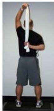
Towel Stretch Hold uninvolved arm over shoulder with towel as shown. Grasp towel with involved arm. Slowly pull upward with uninvolved arm until a gentle stretch is felt.